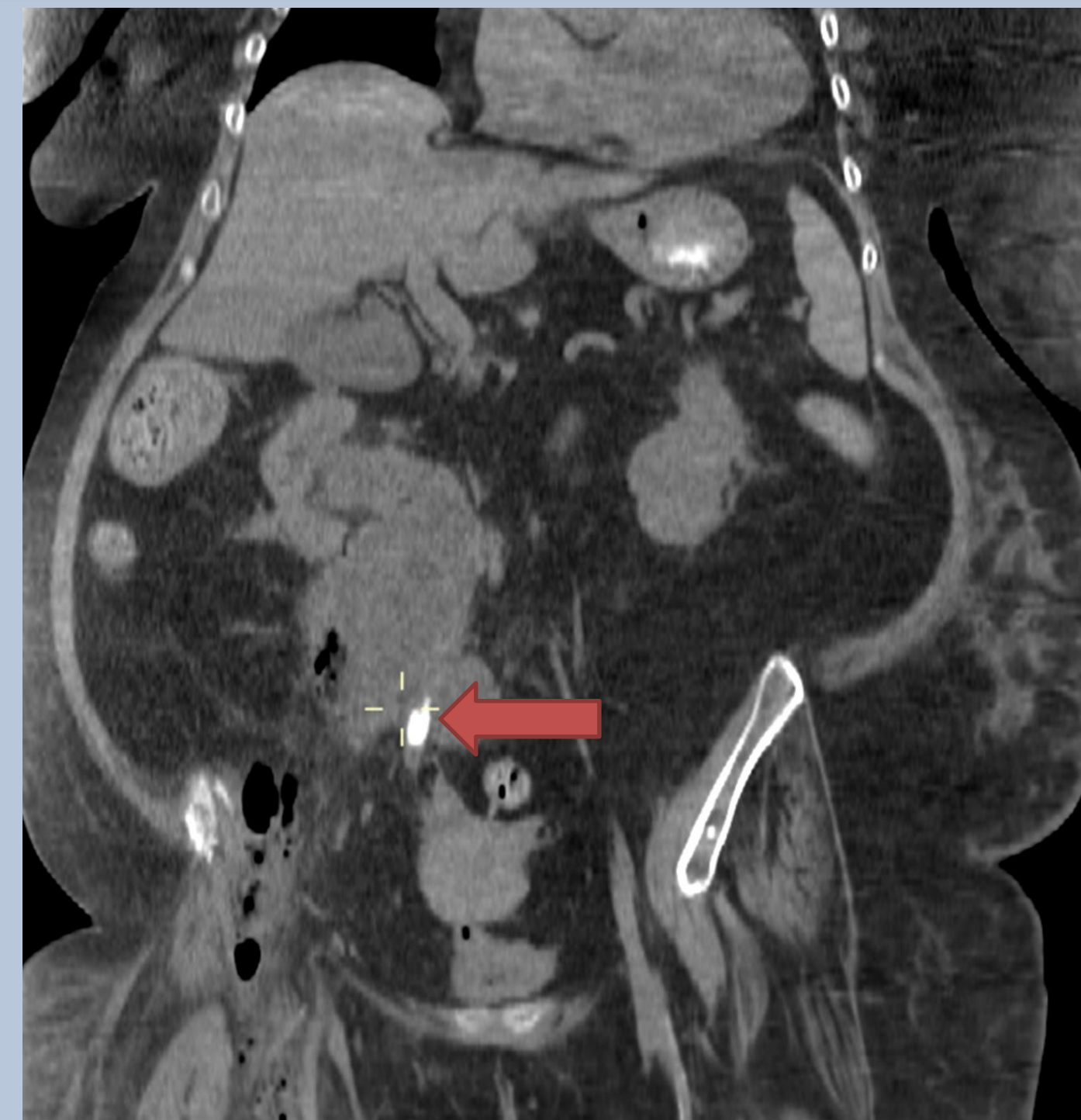
Image 1: CT without contrast demonstrating perforated kidney stone (arrow) with surrounding abscess and air.